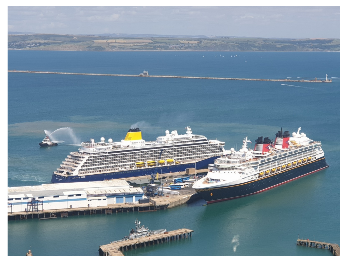
Saga Spirit of Discovery and Disney Magic