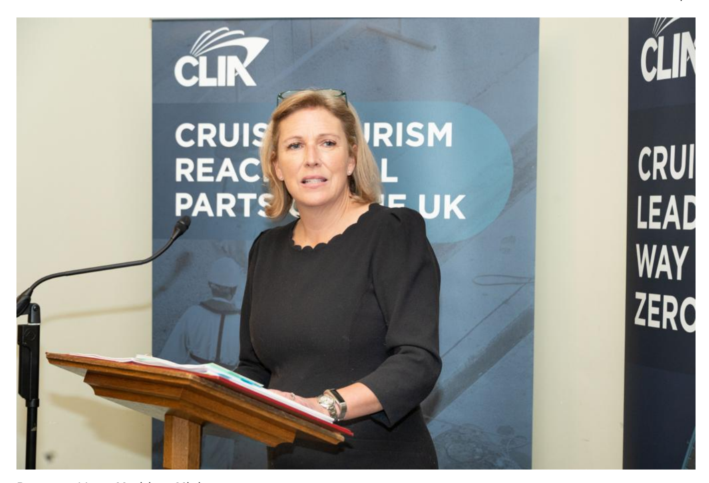
Baroness Vere, Maritime Minister