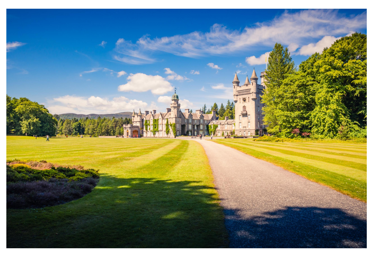
Balmoral, The King's residence in Scotland