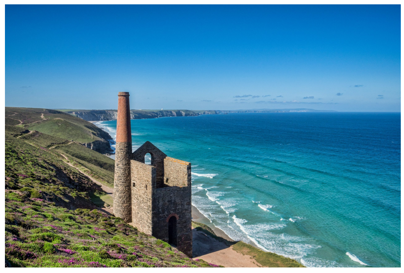
Towanroath Tin Mine, Wheal Coates