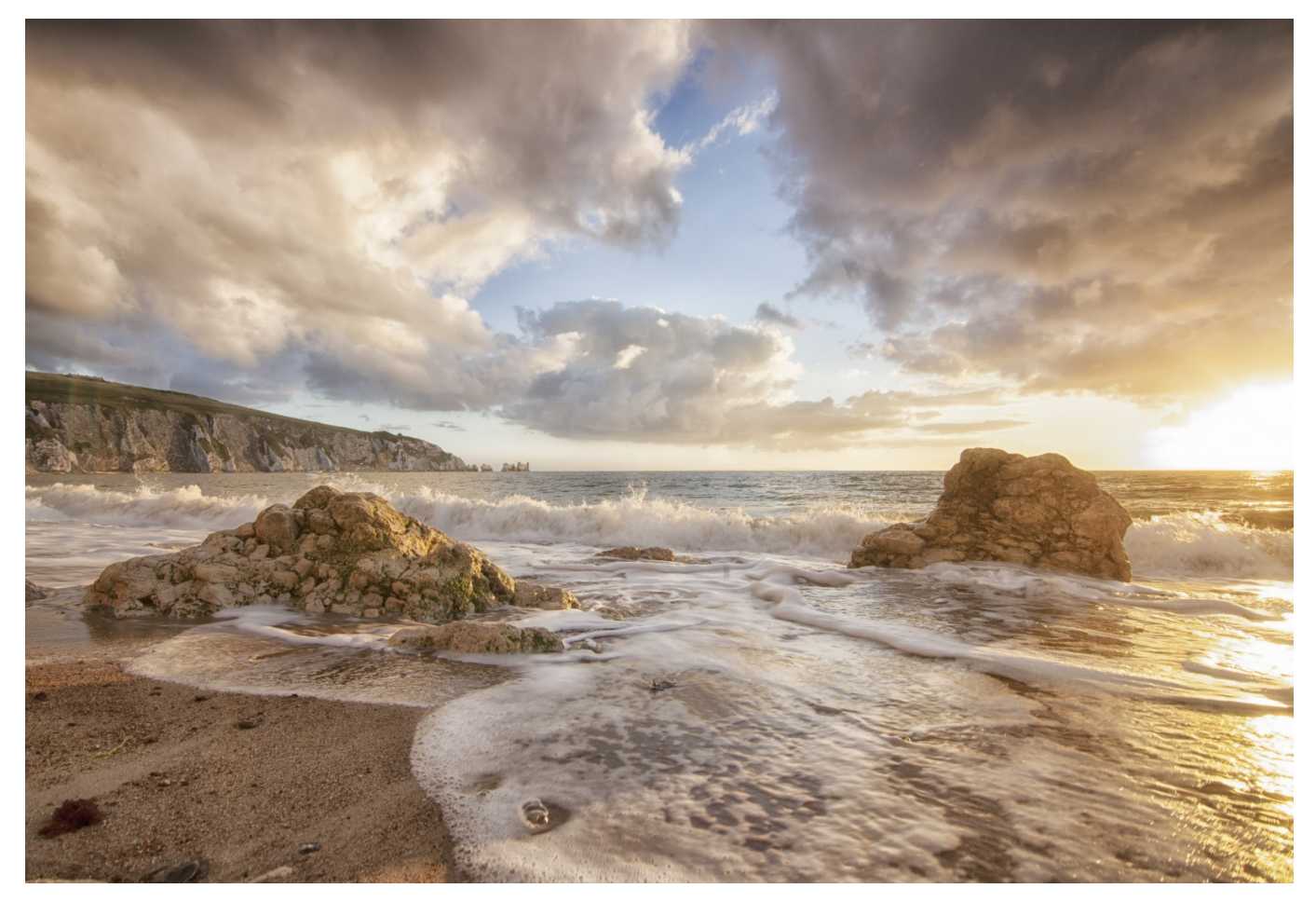
Alum Bay.